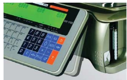
Adjustable Operator Display